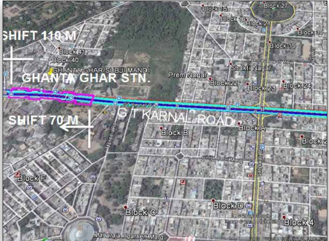
Integrating OpenRail Designer with Google Maps created more comprehensive design visualizations.

rail-based system in the world to get carbon credits for reducing greenhouse gas emissions. The Delhi Metro rail system has helped to reduce pollution levels in the city of New Delhi by 630,000 metric tons every year, thus diminishing global climate change. Many stations have roof-top solar power plants and the metro system has helped remove about 700,000 vehicles off the streets. The Phase IV expansion will make it possible for the organization to continue improving or sustaining a good quality of life for the populations relying on this piece of infrastructure.