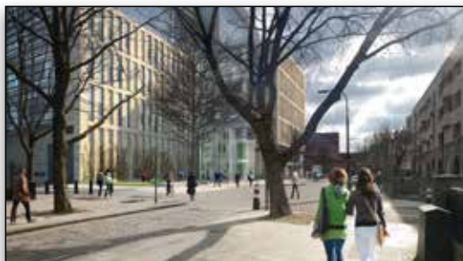
GenerativeComponents allowed PLP to test up to 100 options.

Critically, this activity was not limited to closed meetings within the architectural offices but also played a fundamental role as a presentation tool in discussions with city planners and the team of consultant engineers to meet the project’s environmental criteria.