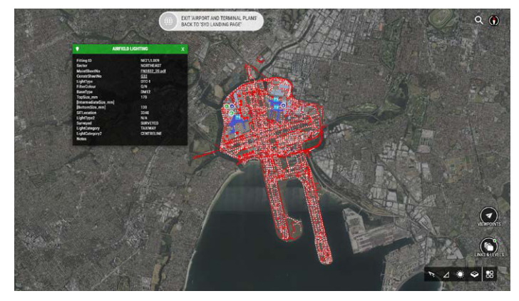
The ability to access all development information within Maps@SYD saves the spatial team roughly 65 resource hours per week.

All users access Maps@SYD via an intuitive web-based portal that divides data into specific sections for different departments and disciplines, such as airport and terminal plans, facilities, development, and safety, sustainability, and environment. Additionally, the system can accommodate reality models created with ContextCapture<sup>™</sup>, providing detailed information on the existing environment, construction data and progress, plus operational assets. "Maps@SYD is a gateway to historical and real-time data from multiple sources, relating to our physical assets, enabling our people to make informed decisions, facilitate predictive outcomes, improve operational and asset efficiency, mitigate risk, and underpin safety," said Michael Smith, airport design officer at Sydney Airport.