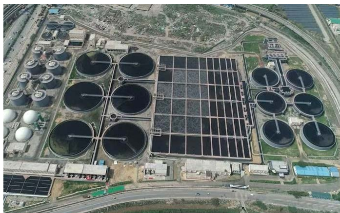
By determining how to support all elements on a single plot of land, L&T Construction reduced the project footprint by 32,400 square meters.

By incorporating the bioreactor in the same plot of land with the rest of the plant components, they no longer needed to build on a secondary plot