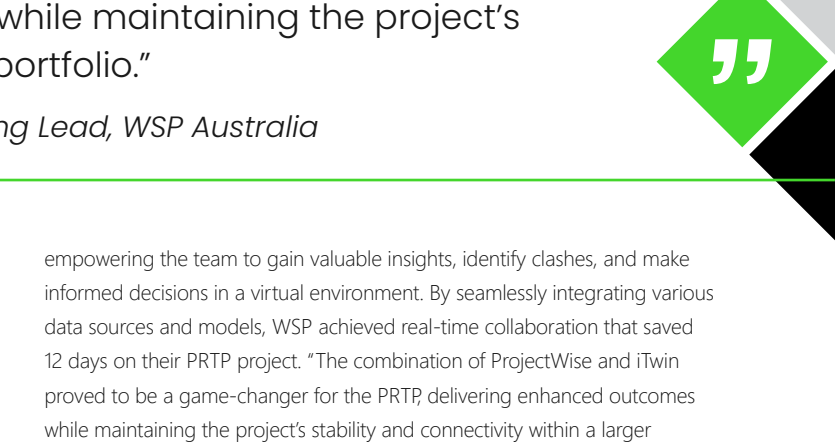
portfolio," said Yammas. Using the PRTP as a digital-centric case study, WSP also saved 300 resource hours, reducing rework.

By transitioning to ProjectWise, WSP significantly improved data management, reduced errors, and enhanced productivity across the organization. Meanwhile, iTwin allowed for comprehensive digital twin capabilities,