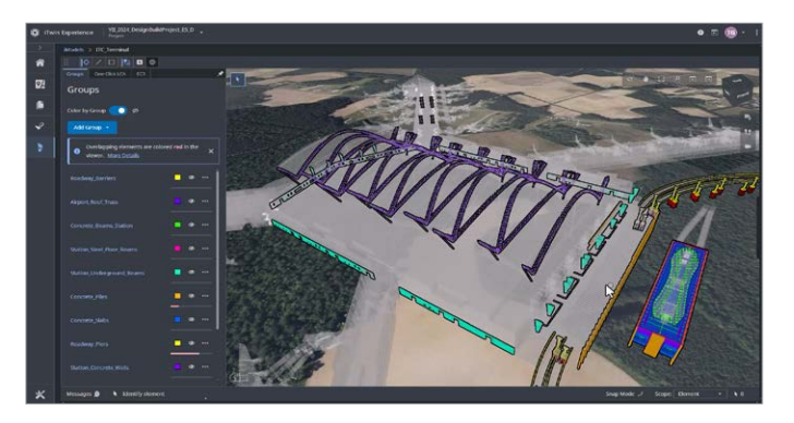
Embodied carbon grouping functionality