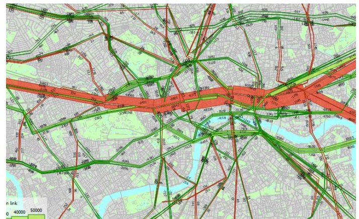
Change in a.m. peak period passenger volumes due to the Elizabeth Line.

Ultimately, the Elizabeth line has transformed how passengers use public transport within London, bringing an additional 1.5 million people within 45 minutes of Central London, alleviating rail network congestion. TfL also forecasts 10 million fewer car journeys per year, reducing traffic congestion and road accidents, and provides a net reduction of 24.6 million fewer grams of carbon emissions per day. The line’s construction has boosted the local economy, with 96% of contracts awarded locally within the U.K. and creating 1,000 apprenticeships. “Railplan has a crucial role in planning the provision of public transport in London. The use of the tool spans tactical tasks, such as informing alternative provision during planned closures, to the most strategic, such as informing the development of mega infrastructure projects,” said Stefan Trinder, principal transport planner at TfL. “The flexibility of the software Railplan is built in means it can adapted for ever-more use cases.