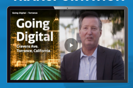
Watch the customer video >